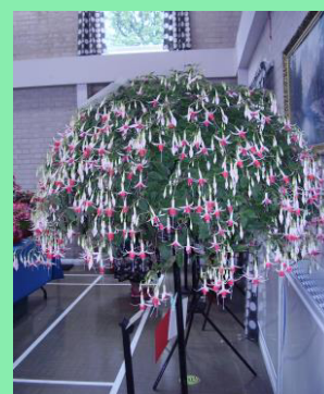
BEST IN SHOW - 2021 'C WOOLSTON'