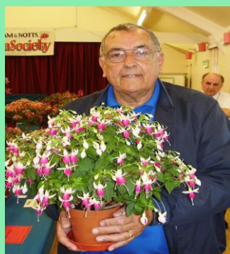
BEST IN SHOW – 2014 'D JOYNT'