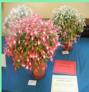
BEST IN SHOW – 2007 'H KILBOURN'

I have also found some photos which I hope you will find interesting!